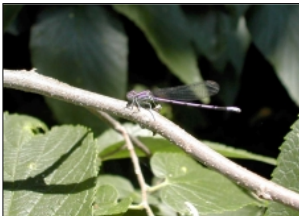
A damselfly takes a rest on the banks of the South River this summer.

Cleanup approaches for aquatic systems like the South River are limited in number, as explained by the National Academy of Sciences' recent report on environmental dredging. The basic triad of sediment remedial strategies consists of monitored natural recovery, capping with clean materials, and digging up and disposing of sediments. These are the only approaches that have been widely applied in the United States. Mercury is perhaps the most troublesome of the aquatic contaminants, and the one for which no known remedy has been completely successful. In the early 1980s, the Commonwealth of Virginia approved a plan for the South River that included eliminating all known