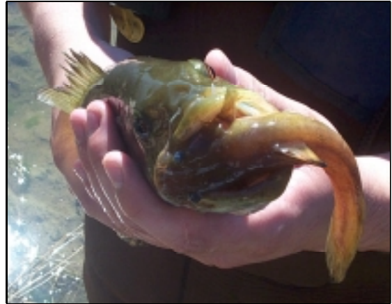
A greedy smallmouth bass with a margined madtom caught in its mouth. The margined madtom, a member of the catfish family Ictaluridae, is a common food item of the smallmouth bass.

Bioaccumulation and Aquatic System Simulator to predict future Hg and MeHg trends in the target fish species.