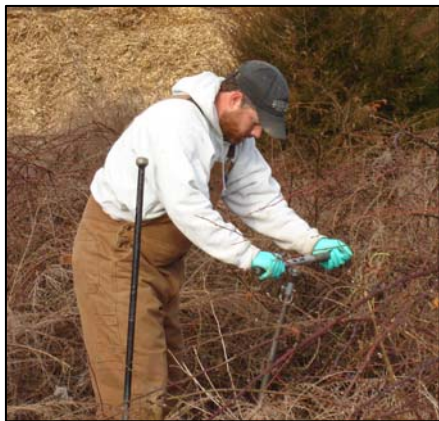
The Science Team collected over 1,200 samples from the South River floodplain.

Mercury in fish in the South River and South Fork Shenandoah River has been investigated since its discovery in the 1970s. Soon after, fish consumption advisories for the rivers were instituted. Although human exposure has always been a focus of the mercury investigations, the Science Team formed a dedicated work group to systematically identify, study, and communicate potential risks and uncertainties associated with human exposure to mercury. The Exposure Task Team consists of representatives from the Virginia Department of Environmental Quality, the U.S. Environmental Protection Agency, the Virginia Department of Health (VDH), the Virginia Department of Game and Inland Fisheries, the Virginia Department of Agriculture and Consumer Services, and DuPont.