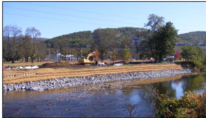
Photograph showing riverbank during placement of the fabric-encapsulated soil lifts.