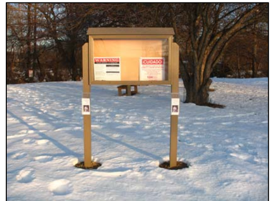
Advisory signs are posted and brochures are available at the outdoor bulletin boards.