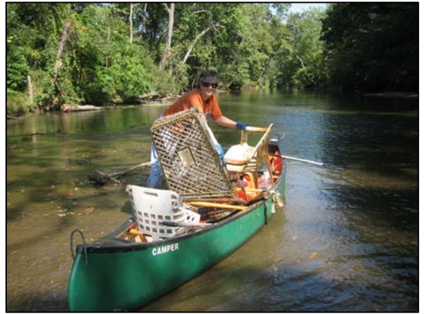
A volunteer loads up a canoe with debris from the river.

Government and business volunteers as well as local citizens participated in the First Annual South River Cleanup on September 11, 2009 as part of our nation's National Day of Service and Remembrance. Individuals from the Virginia Department of Game and Inland Fisheries, the Virginia Department of Environmental Quality, James Madison University, and URS Corporation organized the event where volunteers removed over two tons of debris from 16 miles of river. Fifty-one people volunteered in the cleanup, including individuals from Trout Unlimited, Augusta-Rockingham Monitors, and REO Enterprises. Volunteers split up into five float crews and removed (among other items) 15 shopping carts, 117 car tires, four car batteries, a computer monitor and stereo system, and a toilet. All items collected were sent to the landfill, except for the tires, which were recycled. A true grass roots effort with no budget, the event was supported by local organizations. The City of Waynesboro donated trash bags and gloves, the Augusta County Landfill waived the tipping fees to dispose of the debris, and Riverfest fed the volunteers a delicious breakfast at the start of the day.