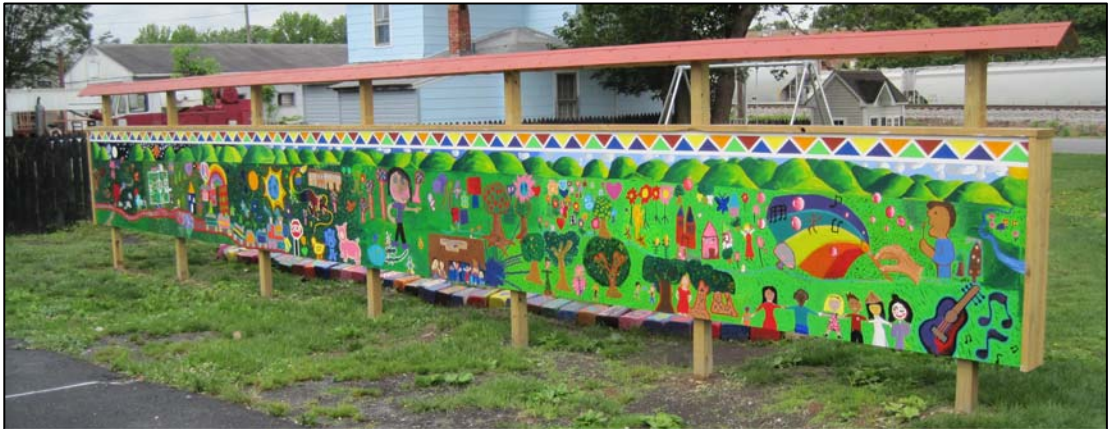
The two-sided, 50-foot long mural depicts children holding hands and playing soccer.

For over two weeks in May, Wenonah Elementary School students and children from Basic United Methodist Church's Casa de Amistad painted a brightly colored mural near the Park Station Villas on North Commerce Avenue.