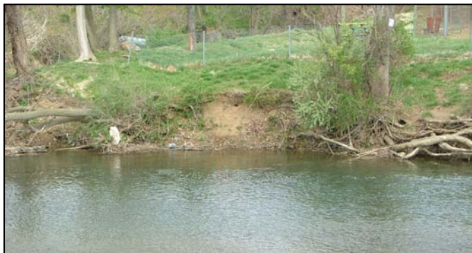
These three pilot study photos (from top to bottom) show an eroded riverbank before, during, and after stabilization.

Evidence collected over the years indicates that the erosion of river bank soil, especially soil containing legacy mercury, is one of the primary mechanisms for mercury entering the South River and becoming incorporated into the food web. Based on this information, the Science Team conducted a bank stabilization pilot study and a carbon amendment pilot study in a floodplain pond. Both of these