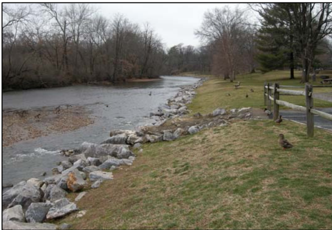
These photographs show current conditions at Ridgeview Park (above) and Wayne Avenue Pocket Park (below).

This photo shows a bioretention filter at Kate Collins Middle School in Waynesboro. A bioretention filter is an engineered system consisting of a shallow, constructed depression that is planted with deep-rooted native plants and grasses. It is designed to slow down the rush of water from hard surfaces (like parking lots) during a storm. Plants and the depression hold the water for a short period of time so that it can naturally be absorbed by the ground. The plant roots and infiltration chambers filter out the pollutants so that the water that ultimately flows underground into the river is clean.